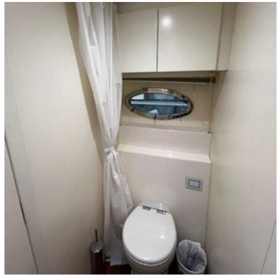
Starboard Crew Head