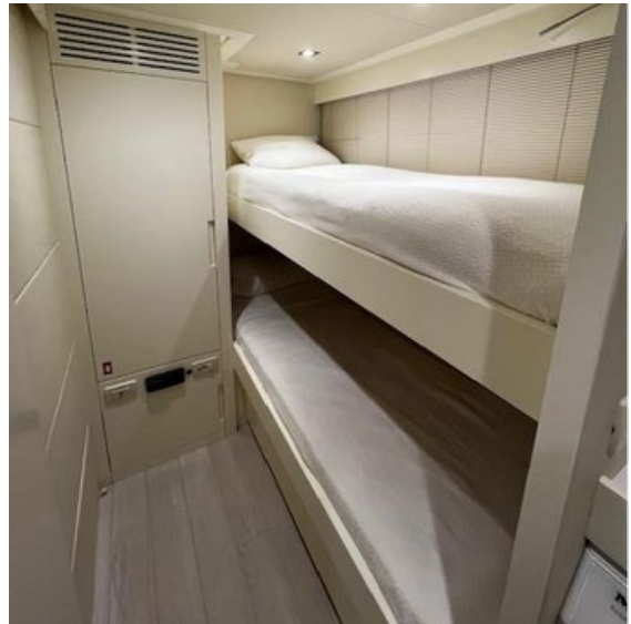
Starboard Crew Cabin