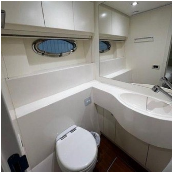
Port Crew Head