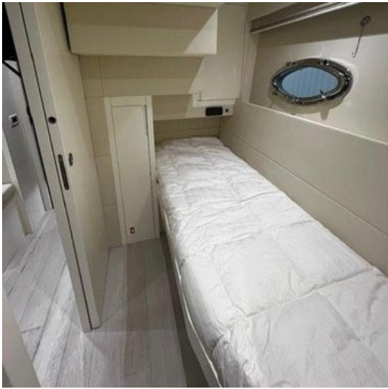
Port Crew Cabin